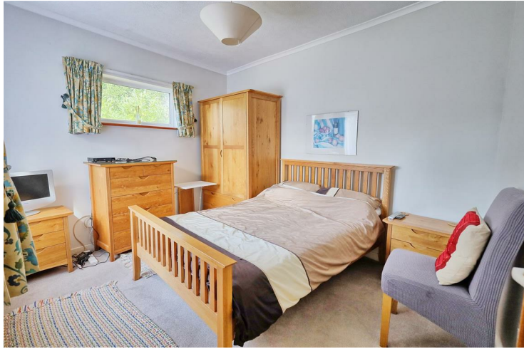
BEDROOM TWO 10'2" x 9'3" (3.12 x 2.82)