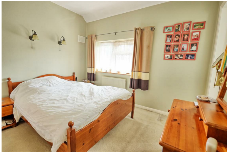
BEDROOM THREE 9'10" x 6'6" (3 x 2)